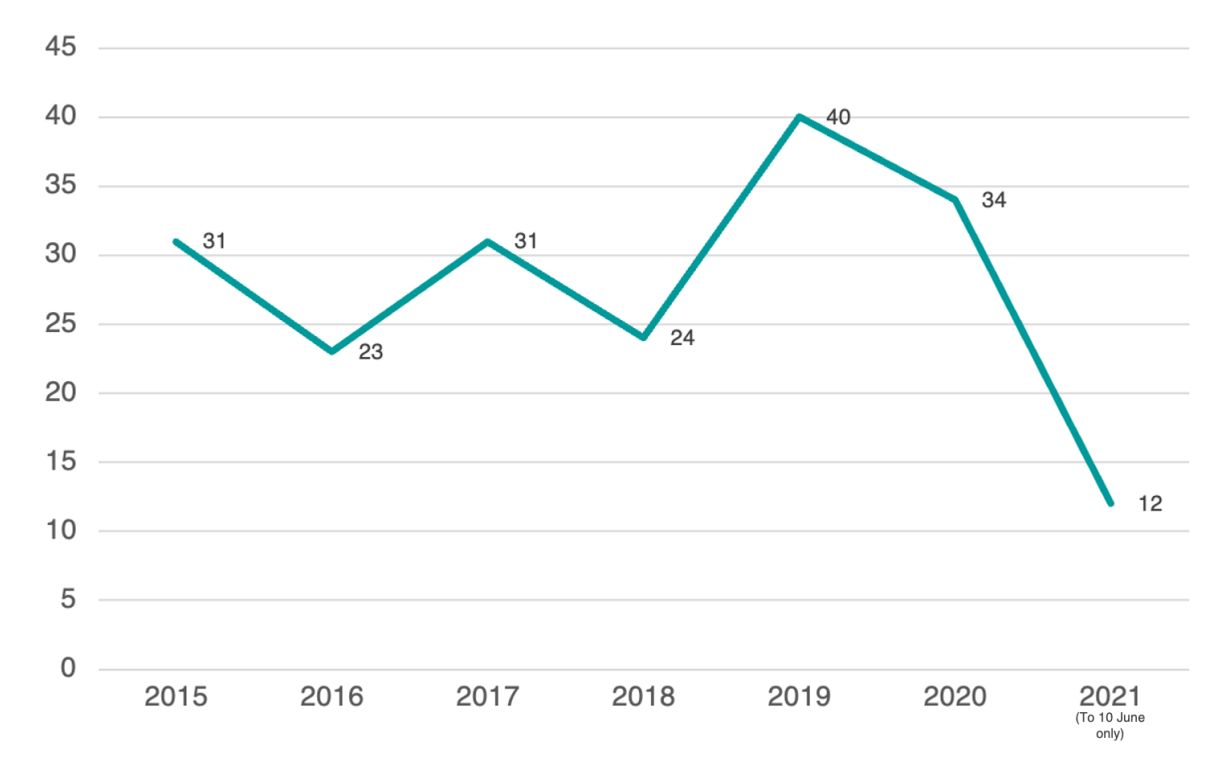
Figure 2. Number of young people referred to the YKC per year for the period of 2015-10 June 2021.

As illustrated in Figure 2 below, referrals to the program ranged from 31 in 2015 to a peak of 40 in 2019. This represents a 29 percent increase over this period.<sup>48</sup> The reduction in referrals from 2020 were a result of the COVID-19 pandemic and the restrictions placed on court operations. Referral numbers per year is presented at Appendix F.